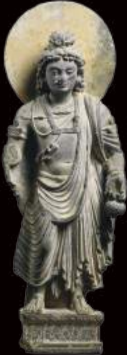
PAKISTAN, Standing Bodhisattva, 1st-3rd century