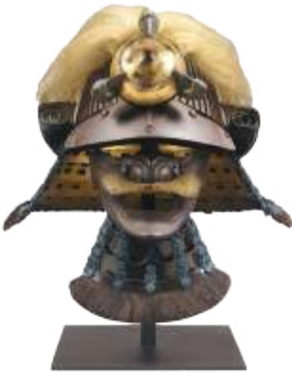
JAPAN, Helmet and mask, 18th or 19th century