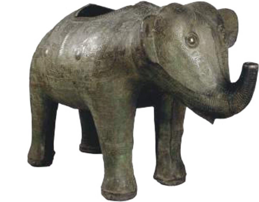
CHINA, Vase also known as «Elephant Camondo», 12th-11th century BCE