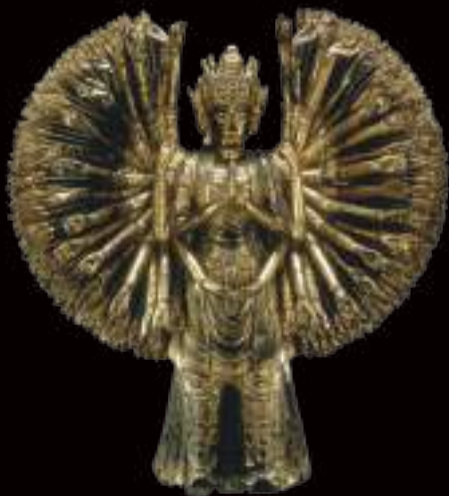
VIETNAM, Bodhisattva Avalokiteshvara, 18th-19th century