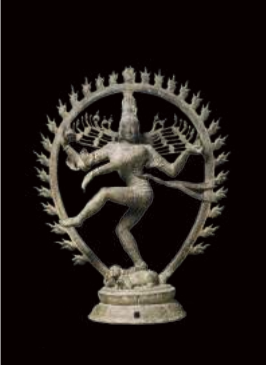
INDIA, Shiva, Lord of the Dance, 11th century