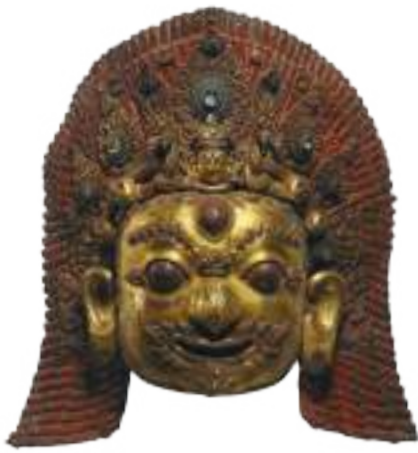
NEPAL, Mask of Shiva Bhairava, late 16th century