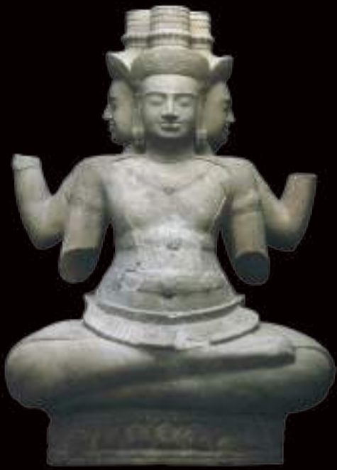
CAMBODIA, Brahma, 10th century