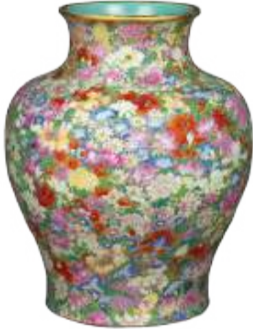
CHINA, Thousand flowers vase, 18th century