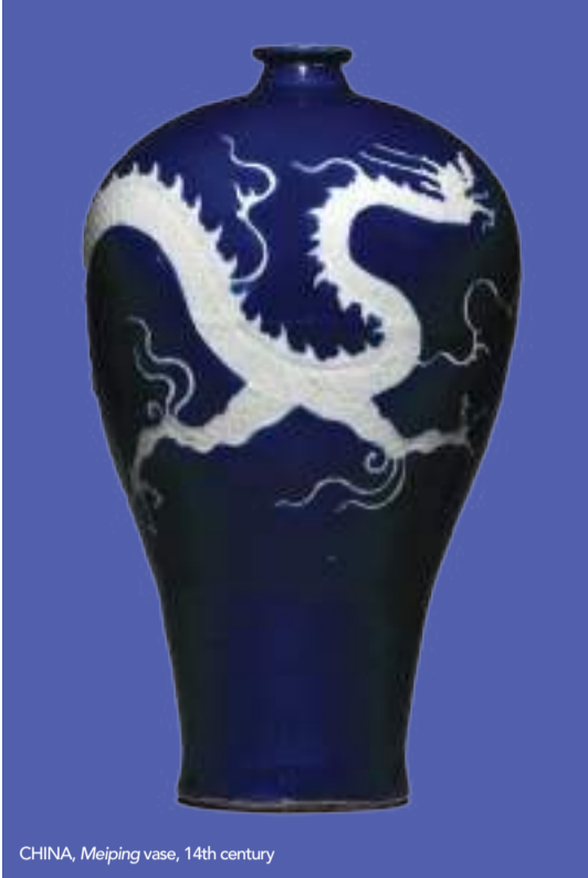
CHINA, Meiping vase, 14th century

Toilets on the lower level and 3rd floor